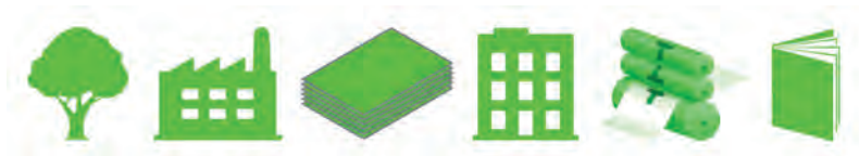
From forest to printed product - the Chain of Custody

This means that raw materials through to the finished paper product can be identified as originating from certified forests.