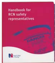
CORPORATE BROCHURES FOLDERS