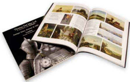
FINE ART CATALOGUES