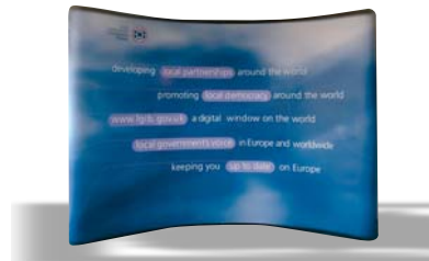
EXHIBITIONS & CONFERENCE SUPPORT